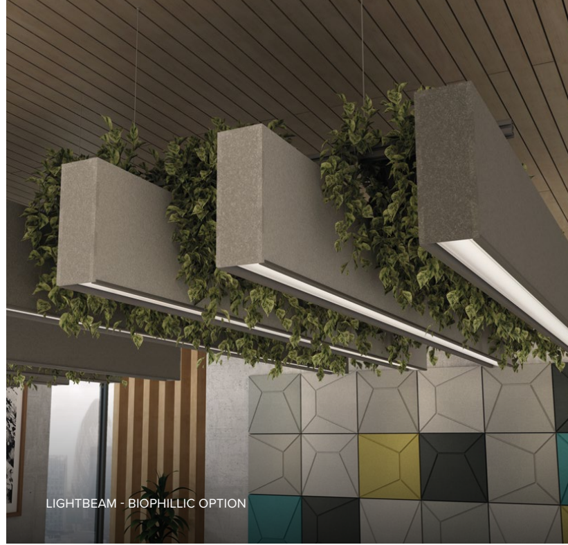
LIGHTBEAM - BIOPHILIC OPTION