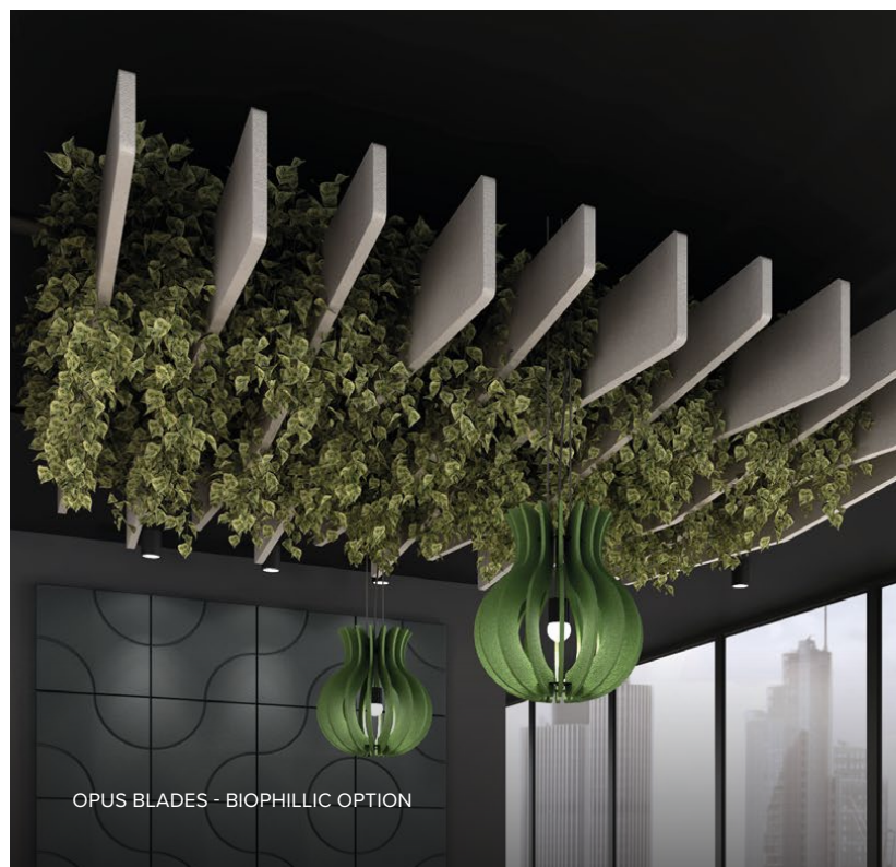
OPUS BLADES - BIOPHILIC OPTION